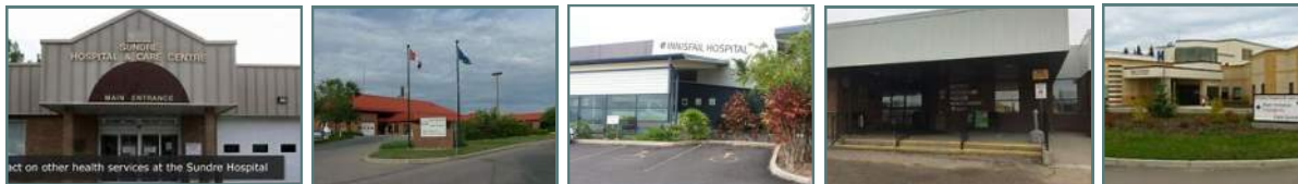
L-R, Sundre, Olds, Innisfail, Rocky Mountain House, and Rimbey Hospitals

We have completed several projects for Alberta Health Services in recent years—we just wrapped up the relocation of the Addictions and Mental Health Services departments in Wainwright and a hospital roof replacement. Now we are undertaking Wi-Fi and data room upgrades at five hospitals—Sundre, Olds, Innisfail, Rocky Mountain House, and Rimbey. We are pleased to continue working with AHS and to expand our growing portfolio of hospital renovation projects.