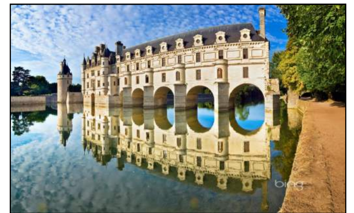
The Chateau de Chenonceau

We're introducing a new contest for Prime Connection —it's called "Name That Architect." The first person to correctly identify the architect of the featured building/structure receives a gift card. Respond here with your answer.