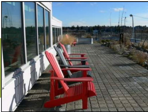
November on the Roof